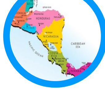
Montessori B-C: Central America