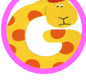
Sound of the week: g