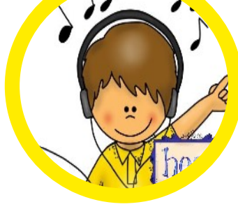
Montessori A: Sense of hearing