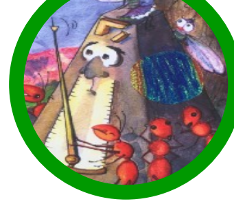
Enrichment: Musical, The Mighty Meter Gnome