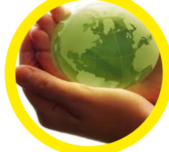
Montessori A: Care for the environment