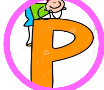
Sound of the week: p

Wednesday, November 15th to Friday, November 17th Details and schedule will soon be announced.