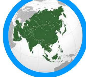
Montessori B-C: Asia