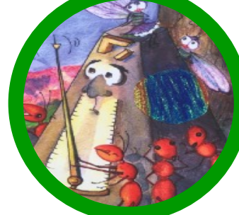
Enrichment: Musical, The Mighty Meter Gnome