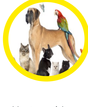
Montessori A: Pets