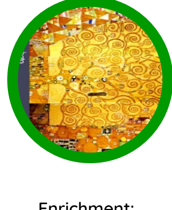
Enrichment: "The Tree of Life" by Gustav Klimt