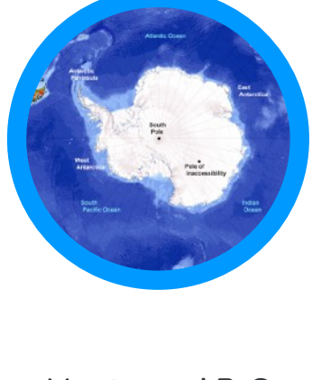
Montessori B-C: Antarctic